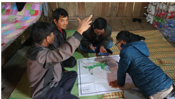
Figure 2 Kon Kun village leaders are sharing on their forest land situation