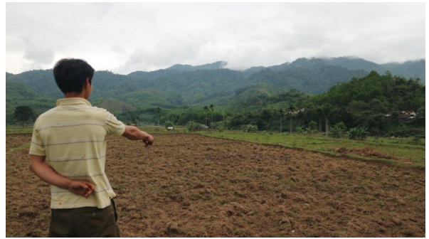
Figure 2 Shortage of water for rice field at Xo Luong village