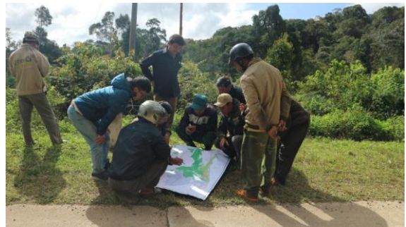
Figure 4 Tu Rang villagers join survey of their village forest land