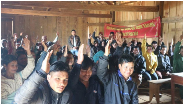
Figure 3 Tu Rang villagers agreeing to revoke land titles from group of households for land allocation to community