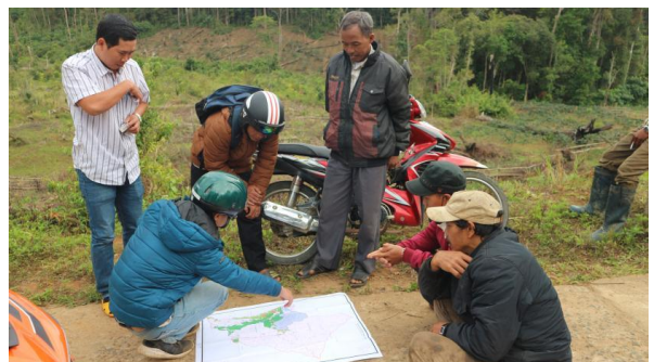
Figure 6 Tu Ma villagers are involving in forest land survey