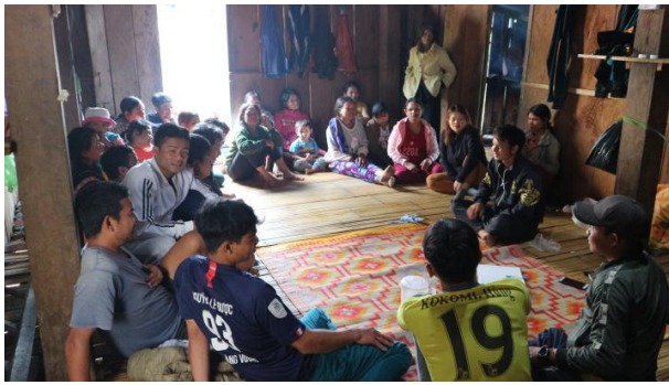
Figure 1 Discussion at Lang Vuong resettled village

The followings are additional images of the project activities: